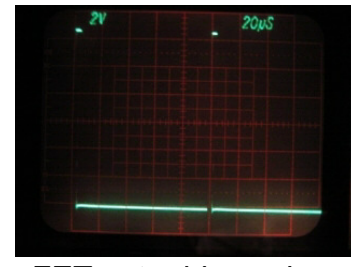
FET gate drive pulse Rate ~ 100us