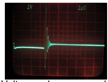
Voltage pulse measured directly across battery