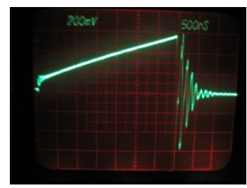
Current pulse measured across 0.1 Ohm Rsense

Pulses from the Roth 10kHz single coil desulfator connected, along with the 13.8 Volt float charger, to a sulfated ~34AHr lawn tractor battery. Tektronix 7623 100Mhz O'scope