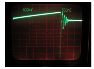
Current pulse adjusted to show neg excursion