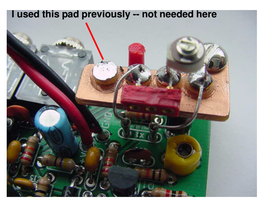
Figure 2. Note use of DIP pins at X1 used as a crystal socket. Also the 3-pin section of DIP pins used on the VXO Supprot.

DIP pins are soldered to the two inside pads for a crystal socket. You could leave 3 pins in the plastic and cut off the middle one. Leads from the board DIP pins are soldered to the two outside pads. I used clipped-off component leads. The capacitor is soldered from the middle pad to the outside ground pad. The rotor on the capacitor should be soldered to the ground side to minimize tool effects.